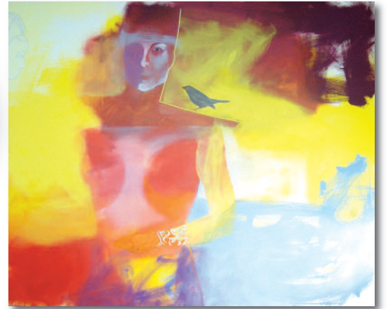
SKY POWER , Ebb Tide , 2012, oil on canvas, 60 x 72"