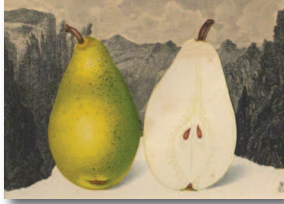
VARUJAN BOGHOSIAN , Two Pears , 2012, collage, 18 3/4 X 22 3/8" framed