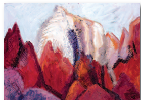
JUDYTH KATZ , Peaks at Zion , I, 1998, acrylic, oil pastel on paper, 22 x 30"