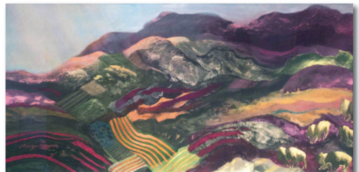
MURRAY ZIMILES , Purple Hills , 2007, mixed media ink and pastel on paper, 19 1/2 x 39"