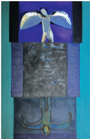
ROBERT HENRY , Above and Below , 2012, oil on canvas, 60 x 40"

Figures, Faces, Fun, Fantasy Mixed media gallery group ex.