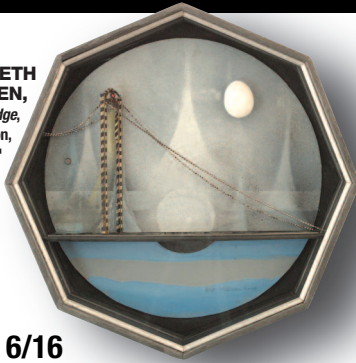
ELSPETH HALVORSEN , Egg Moon Bridge , 2003, box construction, 17 X 17"