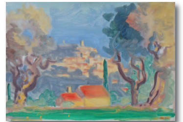
PAUL RESIKA , Fayence Through the Trees , 1991, oil on canvas, 18 1 1/4 X 25 5/8"

Maquettes for Outdoor Sculpture Commissions