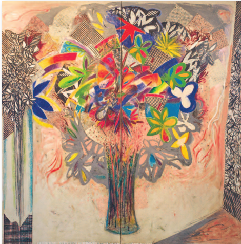
ED GIOBBI , With Flowers , 2010, oil and ink on canvas, 78 x 78"