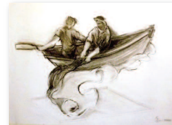
ROMOLO DEL DEO , sketch for "Study for Fishermen's Memorial" charcoal, 40 1/2 x 28 1/2"

Unveiling of ROMOLO DEL DEO'S Maquette "Provincetown Fishermen's Memorial Sculpture"