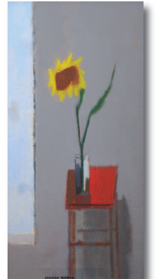
HERMAN MARIL , Still Life With Sunflower , 1975, oil on canvas, 29 x 14"