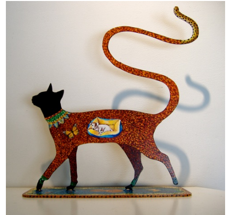
Danielle Mailer, Cat Tales, #2, 2011, acrylic on aluminum, 17 1/2 x 14 1/2 x 5"