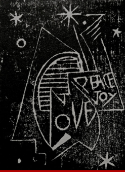
Blanche Lazzell, Peace, Joy, Love, WL print, 1930