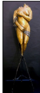
The Vivaldi Bell Series (Mezzo - left/top, Alto - bottom), Sculpture in Bronze Edition 1/5, Life size Female nude ruin on stand, 2008

Romolo's work came to the attention of the curators for the Biennale X 2015 through his successful Kickstarter campaign last year which garnered worldwide attention for the creation of a new studio school for sculpture in Provincetown. They selected three important works from the artist's "Podium Series," -- life-sized bronze figure abstractions on elevated stands.