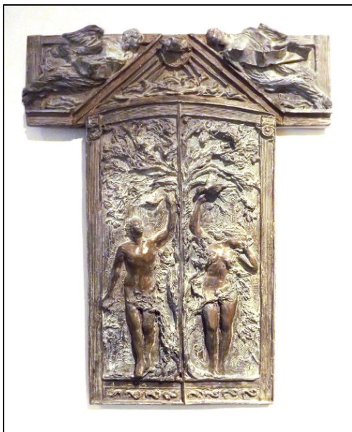
Creation Doors Lintel Maquette, 2000, Sculpture in Bronze Edition 1/5, 3 x 11.25 x 1"