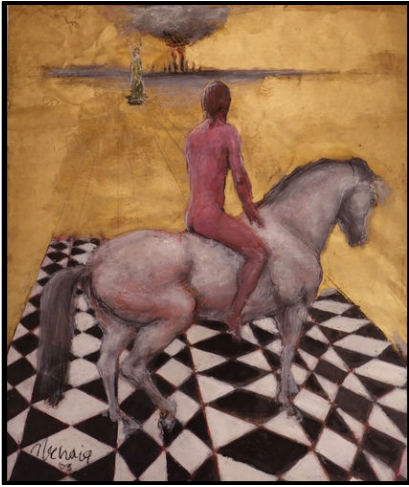
DREAM DRAWING, #3, 25 X 21"

In a conversation with Walker not too many years ago, Craig said: "I love math and geometry. And in these drawings I am able to combine that design with naturalistic figures." People and animals appear, sometimes active, sometimes in stasis: horses, cheetahs, acrobats contorting themselves into tortured shapes. The viewer is pulled into the vastness and locked inside. There is a haunting calm over the scenes reminiscent of the pre-Surrealist Giorgio de Chirico. It is the art of experience translated onto paper with rigid lines and swirling arabesques and Craig is the master conjurer. We are grateful to David Henry Perry, administrator of the Nancy Craig Estate, for helping retrieve these extraordinary drawings so we could exhibit them in Craig's Memory.