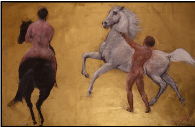
DREAM DRAWING, #5, 24 X 39"