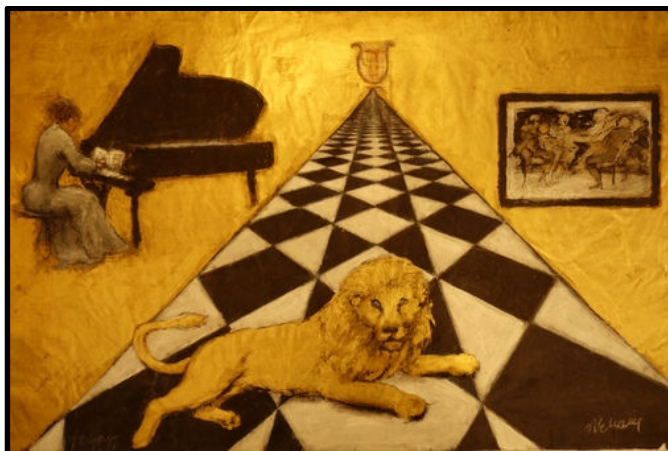
DREAM DRAWING, #4, 26 x 39"

Continuing Exhibition through Memorial Day: "THAR SHE BLOWS"