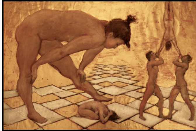
DREAM DRAWING, 6, 25 X 37"

In a conversation with Walker not too many years ago, Craig said: "I love math and geometry. And in these drawings I am able to combine that design with naturalistic figures." People and animals appear, sometimes active, sometimes in stasis: horses, cheetahs, acrobats contorting themselves into tortured shapes. The viewer is pulled into the vastness and locked inside. There is a haunting calm over the scenes reminiscent of the pre-Surrealist Giorgio de Chirico. It is the art of experience translated onto paper with rigid lines and swirling arabesques and Craig is the master conjurer. We are grateful to David Henry Perry, administrator of the Nancy Craig Estate, for helping retrieve these extraordinary drawings so we could exhibit them in Craig's Memory.