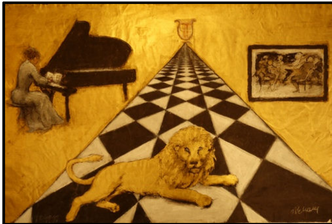
DREAM DRAWING, #4, 26 x 39"

Continuing Exhibition through Memorial Day: "THAR SHE BLOWS"