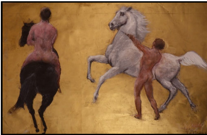
DREAM DRAWING, #5, 24 X 39"