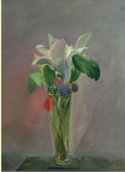
DONALD BEAL, Floral #3, 2014, oil on panel, 40 x 30"

DONALD BEAL, Imagined Reality SKY POWER, In The Realm of Hope