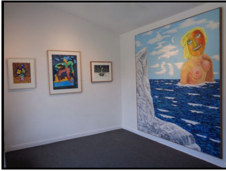
Installation View, CARMEN CICERO