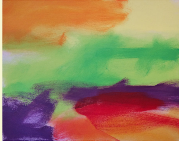
SKY POWER, The Path, 2016, oil on canvas, 24 x 30"