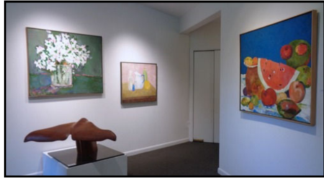
Installation View, GLORIA NARDIN with sculpture by Alan Morehouse